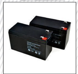
Large capacity battery